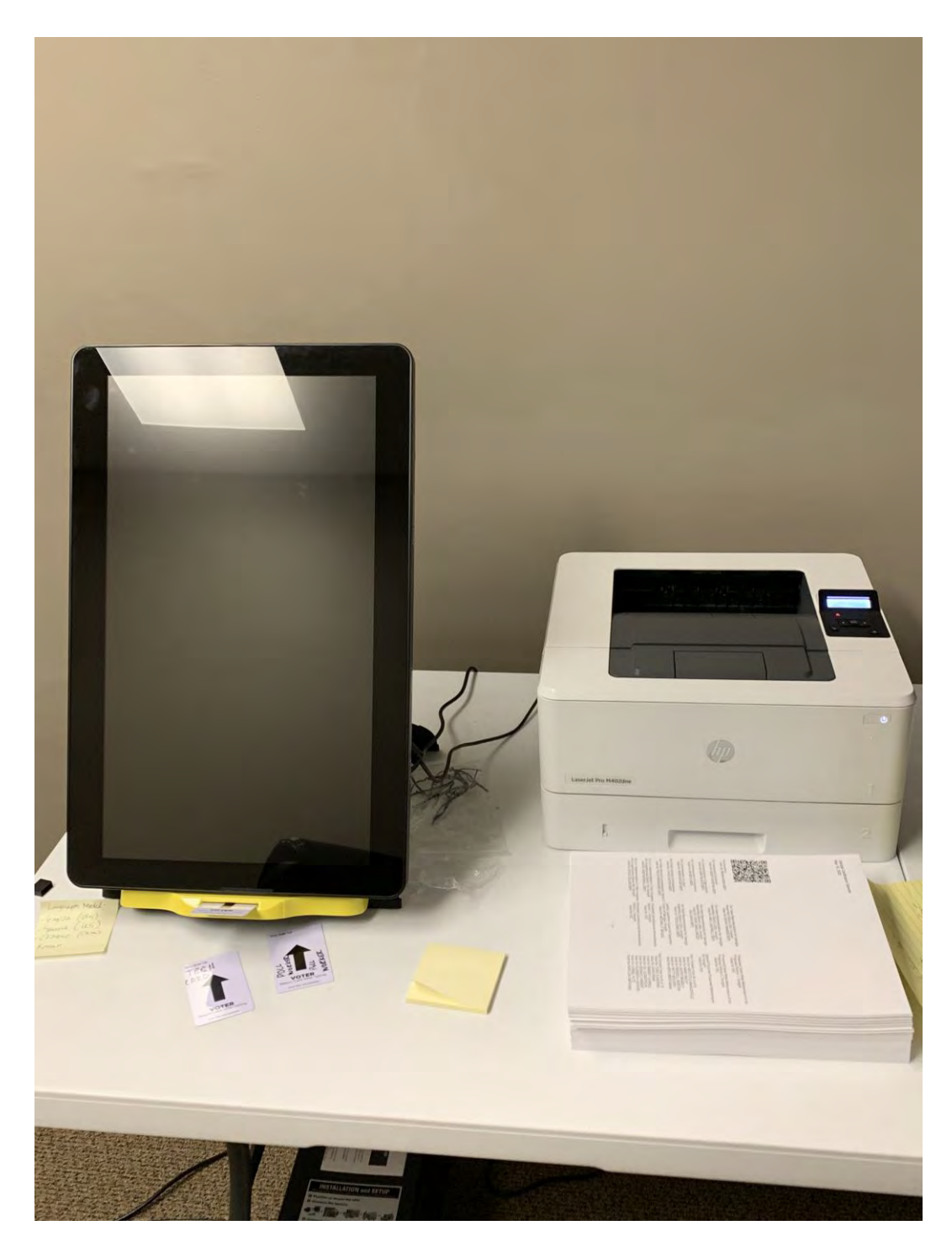
Photograph 5: ICX Prime BMD