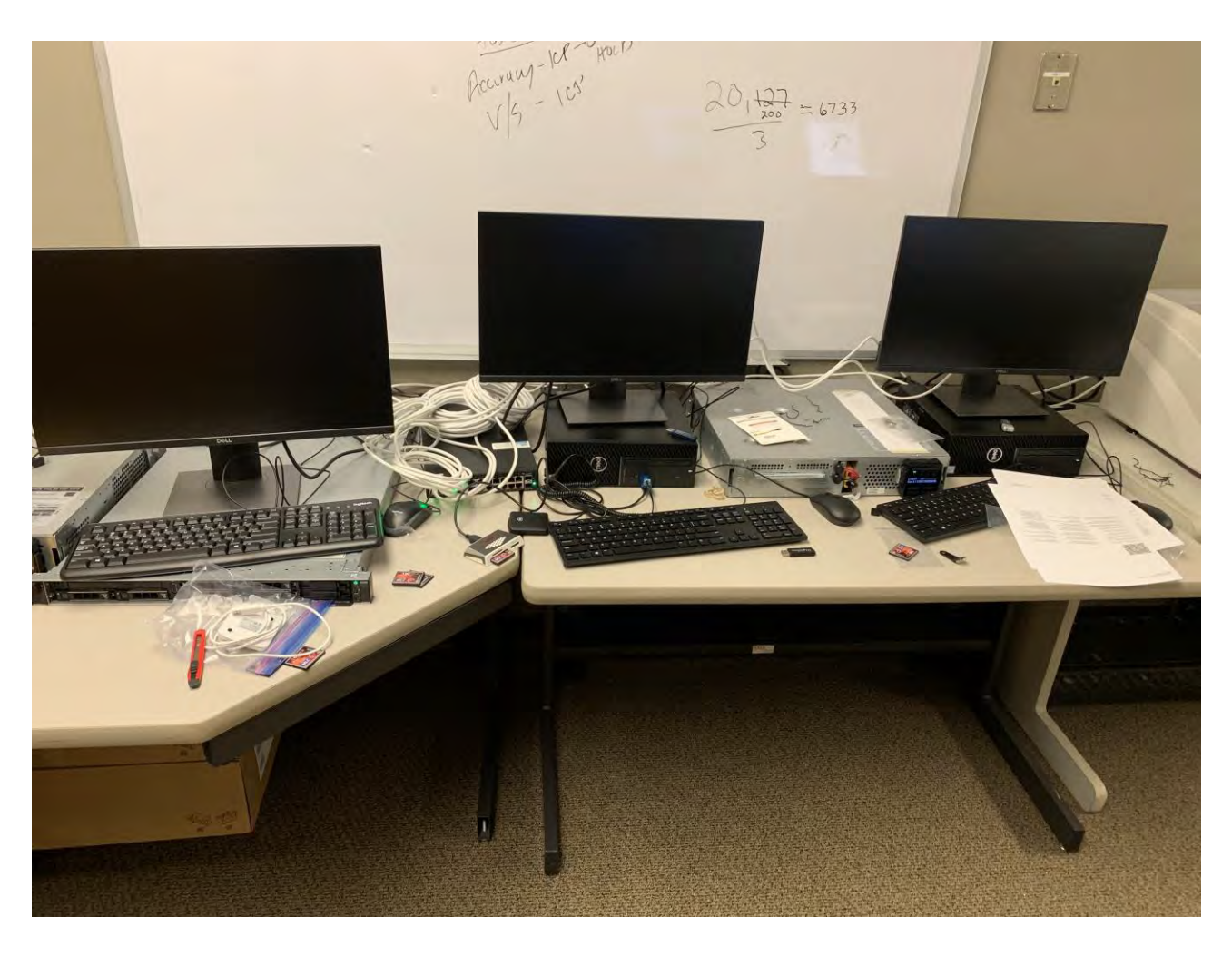
Photograph 2: EMS Standard Configuration