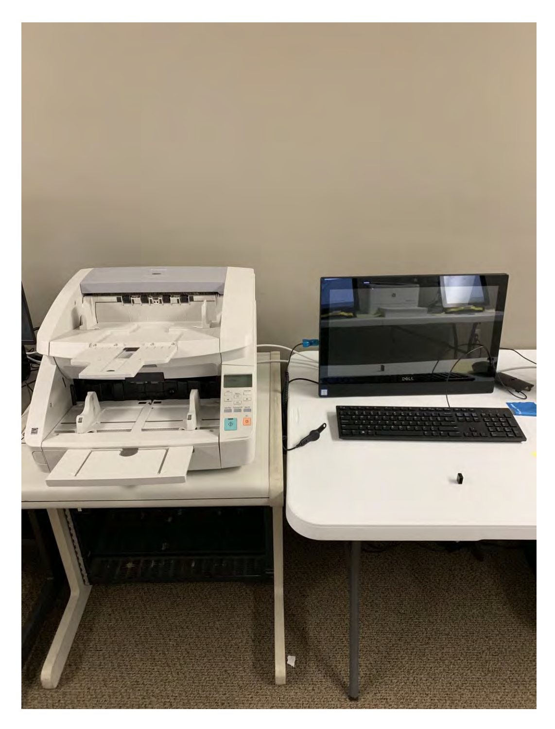
Photograph 3: ICC Workstation with Canon DR-G1130