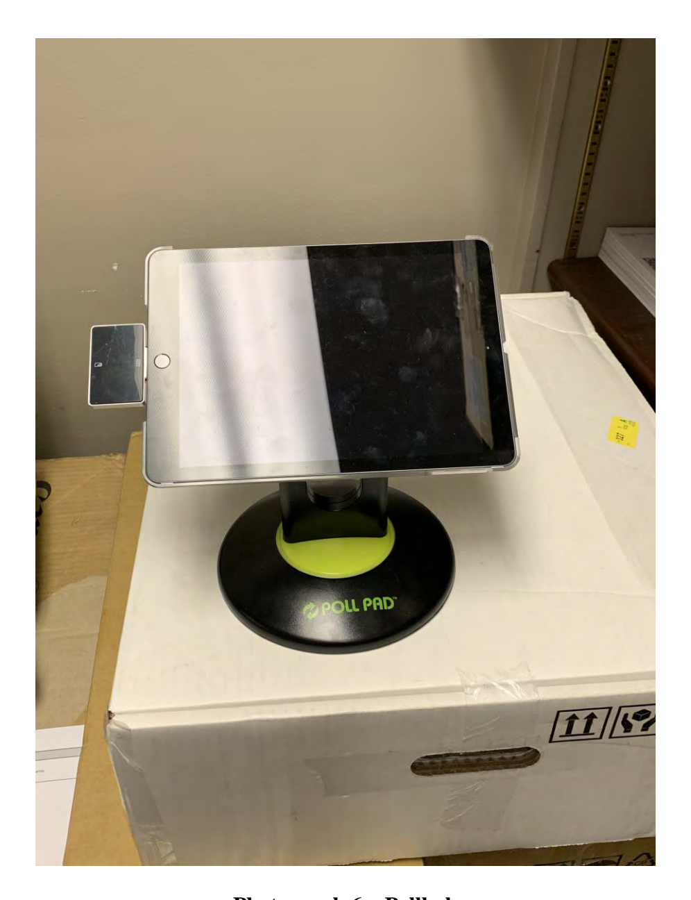
Photograph 6: ePollbok

A pre-certification election was then loaded and an Operational Status Check was performed to verify satisfactory system operation. The Operational Status Check consisted of processing ballots and verifying the results obtained against known expected results from pre-determined marking patterns.