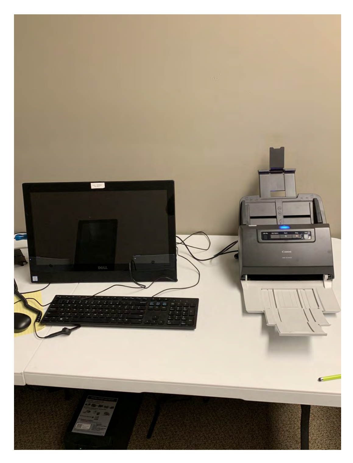
Photograph 4: ICC Workstation with Canon DR-M160II