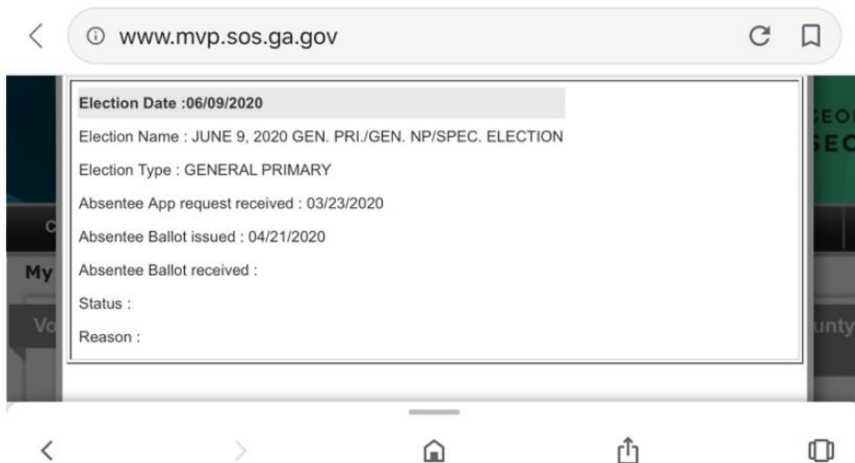
Exhibit 1: Screen shot from Jerry Stamey's My Voter Page on June 18, 2020