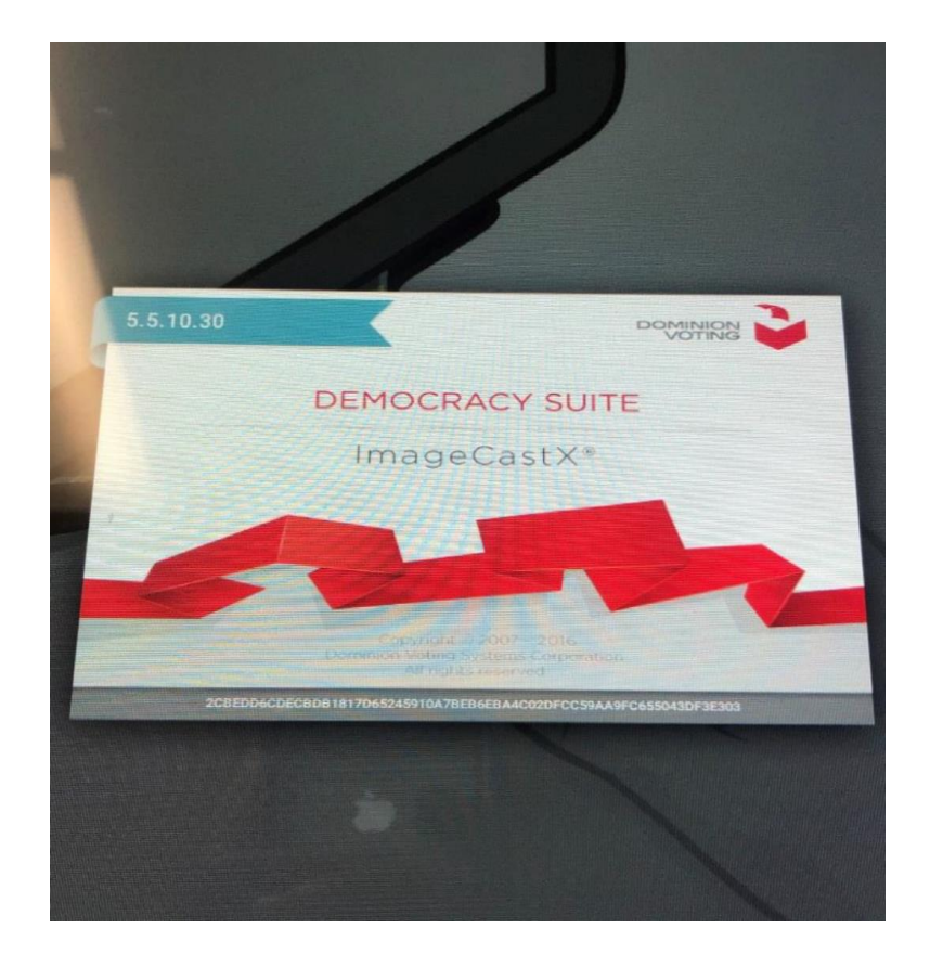
Photograph 2: Viewable Hash Value

8. With our assistance, Georgia performed acceptance testing of each BMD using a hash value. This ensured that the BMD had not been altered and had the correct software installed at the time it was accepted by the State.